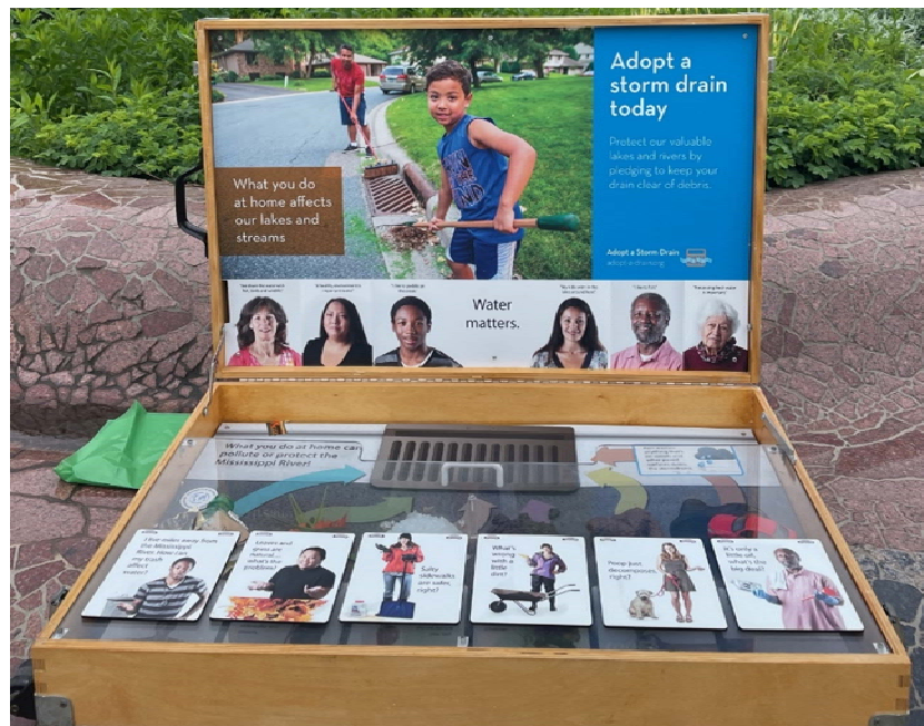
Above: The Adopt-a-Drain exhibit helped table visitors deepen their understanding of everyday actions we can take to protect local lakes and streams.