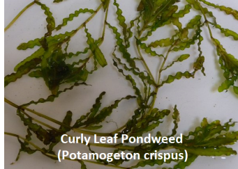
Curly Leaf Pondweed (Potamogeton crispus)

The channel between Pleasant and Sucker Lakes has been eroding along its western side. Efforts to stabilize the channel using asphalt, concrete and rock have not worked and the area continues to deteriorate. Learn more.