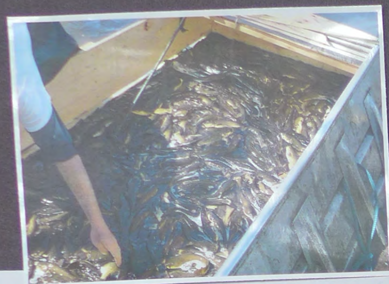
♠ Project to drastically lower bullhead population, a rough fish species, to increase water quality

♦ Rough fish stir up sediments in lakes, releasing nutrients that promote algal growth that can lead to decreased oxygen levels, and even fish kills