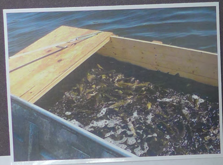
♦ Several more years of sampling must be done to further assess effect on water quality