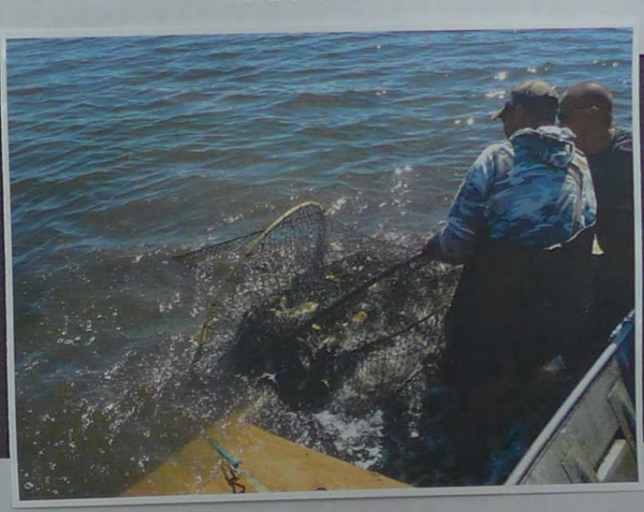
♦ Since the removal of more than 16,000 pounds of bullhead, citizens say that the water clarity has improved

♦ Rough fish stir up sediments in lakes, releasing nutrients that promote algal growth that can lead to decreased oxygen levels, and even fish kills