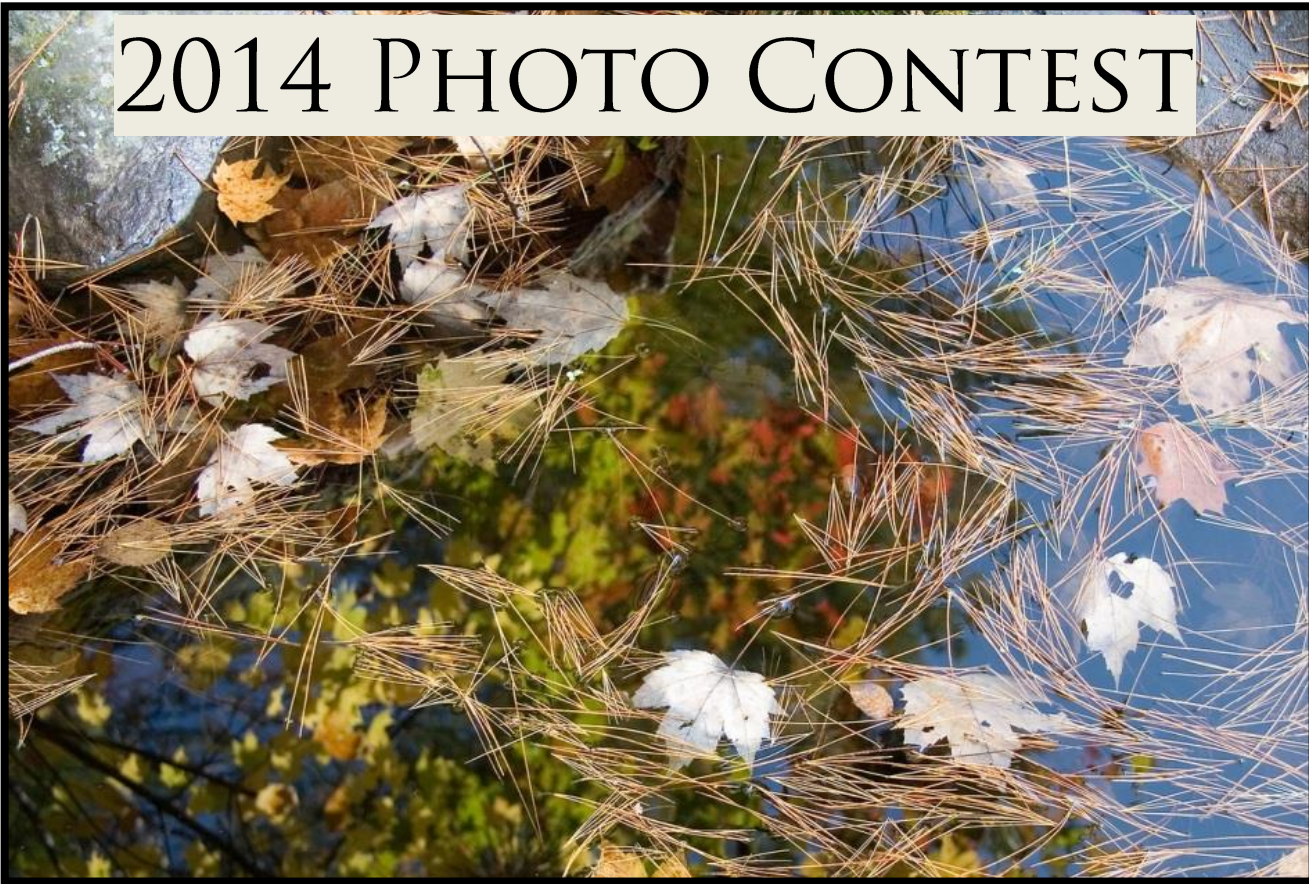
Transitions – Thomas W. Carlson

Calling all photographers! The Vadnais Lake Area Water Management Organization (VLAWMO) is seeking pictures of local lakes, parks, wildlife, plants, and outdoor recreation in one of four categories: