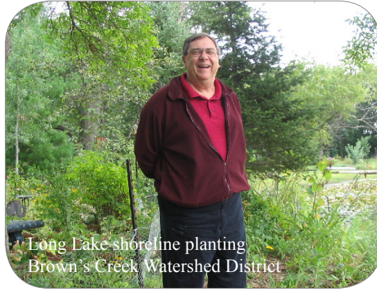
Long Lake shoreline planting Brown's Creek Watershed District

Unlike turf, native vegetation requires no mowing, watering or chemical applications.