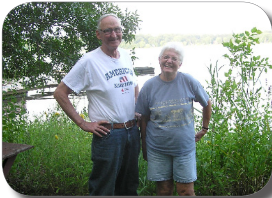
Lake Jane shoreline planting Valley Branch Watershed District

Sit back, relax, and let nature care for your waterfront property. That's right - we're giving you permission to let your yard run a little wild.