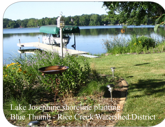
Lake Josephine shoreline planting Blue Thumb - Rice Creek Watershed District

The plants' roots prevent lakeshore erosion and streambank slumping.