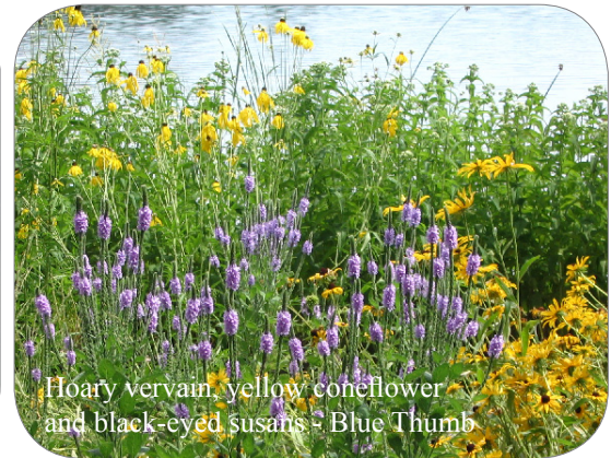
Hoary vervain, yellow coneflower and black-eyed susans - Blue Thumb

Unlike turf, native vegetation requires no mowing, watering or chemical applications.