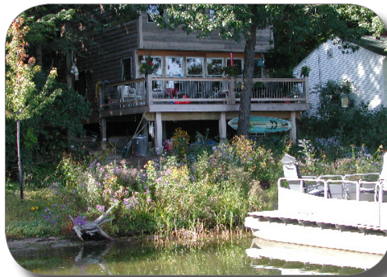
Big Carnelian shoreline planting Carnelian-Marine-St. Croix Watershed District

Many people feel pressure to keep their yards tidy by mowing the grass down to the water's edge, building retaining walls or removing shrubs and tall grasses.