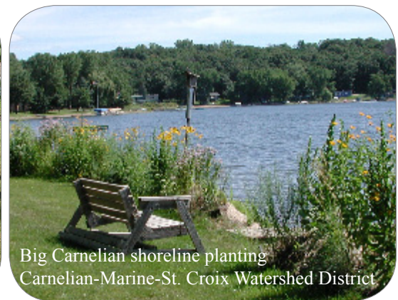
Big Carnelian shoreline planting Carnelian-Marine-St. Croix Watershed District

You can still have a dock or trail to the water while keeping the rest of your shoreline in a natural state.