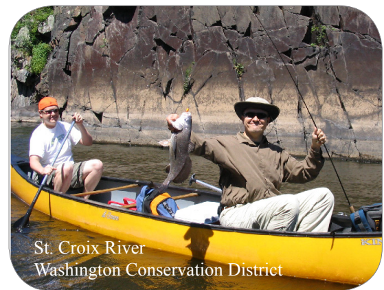
St. Croix River Washington Conservation District

Native plants clean polluted runoff and provide fish, bird and wildlife habitat.