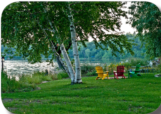
Lake Josephine shoreline planting Blue Thumb - Rice Creek Watershed District

In reality, a buffer of native plants including flowers, grasses, shrubs and trees is easier to maintain, helps to prevent erosion and keeps the water cleaner.