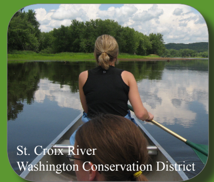
St. Croix River Washington Conservation District

Learn more about shorelines at www.BlueThumb.org