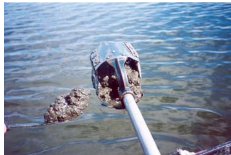
Figure 1. Soil auger used to collect lake sediments.

Reporting Lake Soil Analysis Results: Lake soils and terrestrial soils are similar from the standpoint that both provide a medium for rooting and supply nutrients to the plant.